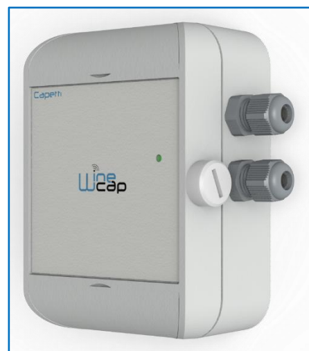
Picture 1 - Product image